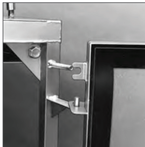
AstroSeal® Type S housing with access door open shows how the door rests on the pin hinge. The locking bolt and large gasket on the inside of the door are also shown.

AstroSeal® Type S housings are available with a 2" or 4" wide prefilter track. Blank off panels are provided to prevent prefilter bypass. Prefilters are accessed through the final filter access door.