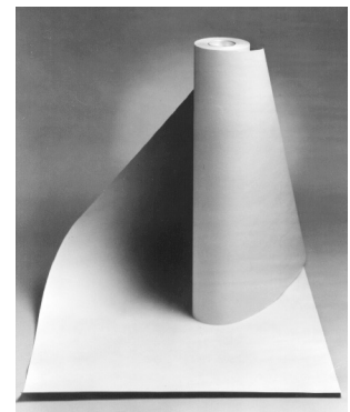
Our Paint Booth Floor Paper is available in a variety of widths.

Kraft paper available in a variety of widths to save time and money while protecting paint booth floors and surfaces from spills and oversprays.