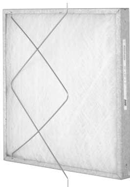
AmerFrame® filter media frames are available in 1" and 2" thickness for installations into standard 2" universal holding frames. They are built rugged for years of dependable service.