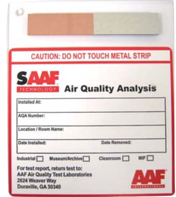
Reactivity Monitoring Coupon — Glass p/n: 392-801-000