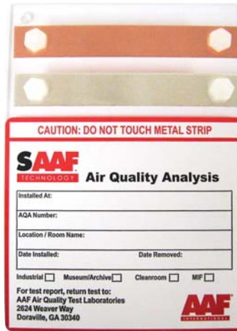
Reactivity Monitoring Coupon — Metal p/n: 392-801-001