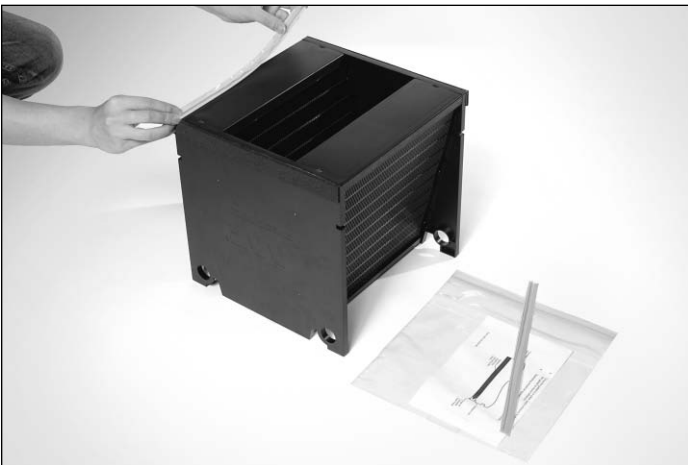
Step 2: Locate the gasket on the edge of the leaving-air side face of the half-cassette as shown and firmly press the gasket into position so that it adheres to the face of the half-cassette.