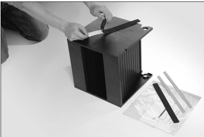
Step 1: Remove the paper strip on the back of the black gasket to expose the adhesive.