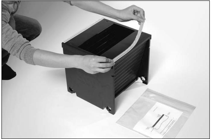
Step 3: Repeat to install the second butterfly gasket on the other side of the leaving air side face of the half-cassette.