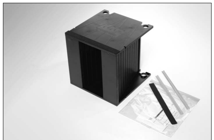
Step 3: Firmly press the gasket into position so that it adheres to the side plate.