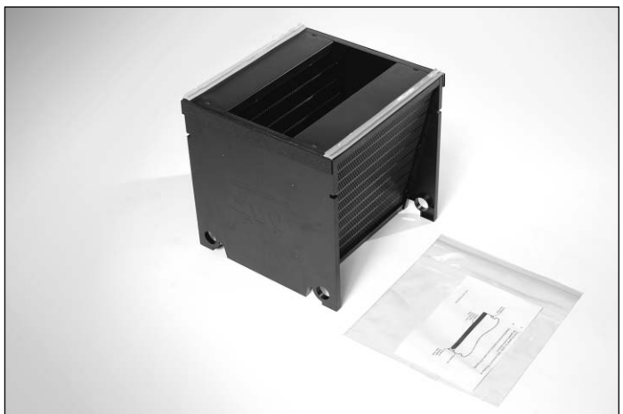
Step 4: The Type HD half-cassette is now ready for installation into the Side Access Housing.