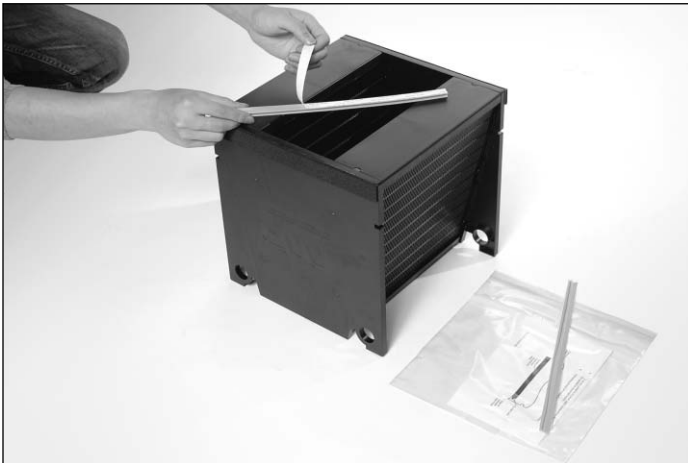
Step 1: Remove the paper strip on the back of the yellow "butterfly-style" face gasket to expose the adhesive.