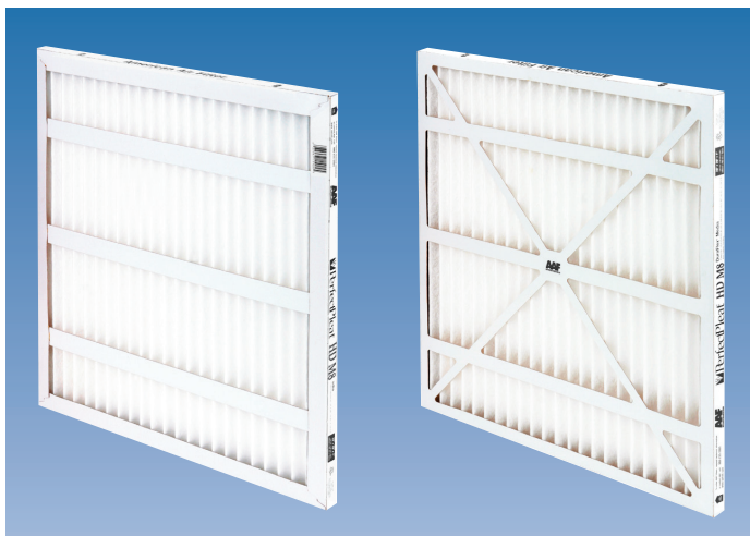
PerfectPleat® HD M8 1" filter air entering side

The PerfectPleat HD M8 filter is not intended for standard applications, with normal variations in temperature or airflow. PerfectPleat filters can handle those conditions. The PerfectPleat HD M8 filter is the choice when an application routinely challenges filters with very low temperature (down to -40°F/-40°C) and/or high turbulence. If your application has these characteristics, the PerfectPleat HD M8 filter is the ideal choice.