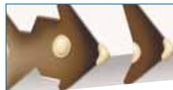
Pleat Stabilizer Adhesive Detail: Media pack is structurally bonded with hot melt.