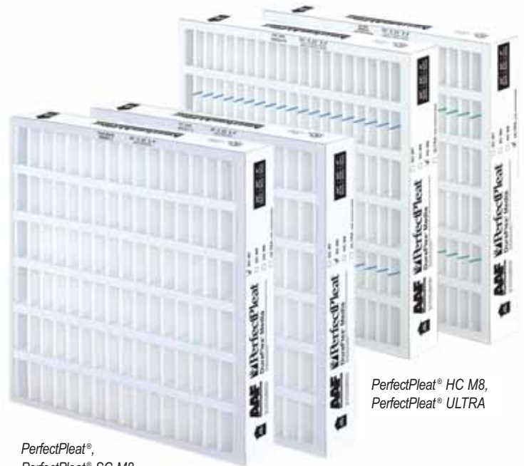
PerfectPleat®, PerfectPleat® SC M8

The result is fit and finish unlike anything available in a 4" pleat, coupled with excellent strength and durability. All frame components, straps, and pleat spacers are constructed of .028 beverage containerboard with the highest wet-strength available.