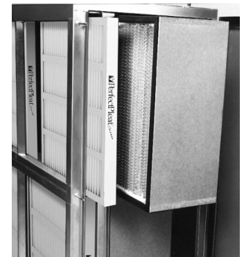
Two-inch PerfectPleat® pleated filters are shown installed in the prefilter track on the upstream end of the housing in front of AstroCel® HCX final filters.

Available in a wide range of efficiencies, cell side materials, and separator designs, AAF manufactures and tests AstroCel filters to fit HVAC HEPA housings.